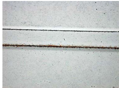
Figure 1. Red rust on tension bends of prepainted HDG.

Hot-dip galvanized steel is coated with zinc, which provides corrosion resistance to the steel substrate. After severe bending or forming, fine cracks may develop in either the paint or the zinc coating on the tension side of the bend. At the initial stage of corrosion, zinc sacrifices itself to protect the underlying steel. White corrosion products might be observed around the fine cracks in the paint on the tension bends since the products of zinc corrosion are white. As the corrosion progresses, the zinc underneath the paint is consumed and the paint flakes off since there is nothing for the paint to adhere to. Red rust may subsequently developed on the underlying steel. This process may take years to initiate depending on the environment, the paint system used, thickness of the zinc coating, and the severity of the strain or radius of the bend involved. Figure 1 shows an example of red rust on the tension bends of a prepainted HDG roofing panel after several years of outdoor exposure.